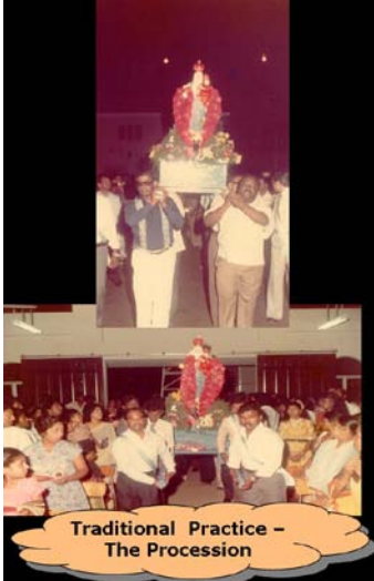
Traditional Practice - The Procession